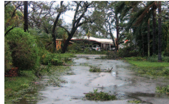
October 2005: Hurricane Wilma

repair. As I write this, I feel that time has tempered our fear. Please don't let that happen. I invite you to briefly return to memories of the days following those storms, and remind yourselves that you can prepare better than ever this year.